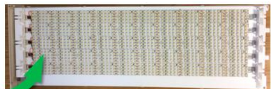
Backlight Update Service LED (Light Emitting Diode)