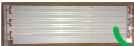
Legacy CCL (Cold Cathode Lamp)