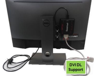
The GF VT 08 is available in free standing, VESA wall mount and custom panel mount versions.