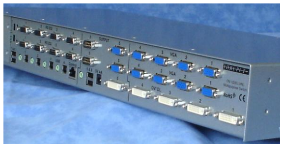
Front view of the GF 1030 SW multipurpose switch.